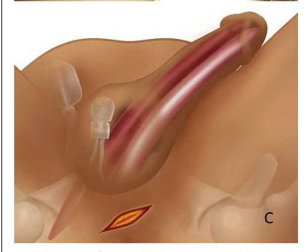
Fig. 2 The incision of our novel technique. a Incisional line drawn by a sterile surgical marker and the actual longitudinal incision of 2-cm over the affected cylinder ( b ). c Artwork revealing the underlying anatomical structures around the incision

was initially used. This incision also allows us to repair proximal cross-over and to re-position a proximally migrated cylinder or RTE back into the corpora. Then, the tunica albuginea is sealed carefully by a running and tight 3-0 monofilament absorbable stitches. The fascia